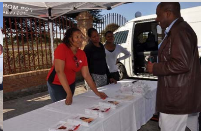
National Blood Transfusion Services stall

SADCAS promotional materials were also distributed during the celebrations and pull up and teardrop banners were also put up at the venue to maximize the awareness on the World Accreditation Day. The 2016 WAD commemorations held in Jwaneng, Botswana was indeed a success.