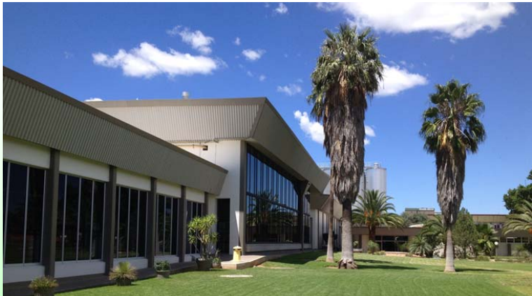
NBL Offices in Windhoek, Namibia

introducing more countries to NBL's portfolio of quality brands amongst which are Heineken, Hansa draught beer, Windhoek Lager and Amstel lager. The brands in NBL's portfolio continue to garner international recognition, winning a series of gold medals during the prestigious Deutsche Landwirtschafts Gesellschaft (DLG) Awards. In order to assure the quality of their products Namibia Breweries operates a Laboratory which has embarked on the ISO/IEC 17025 journey.