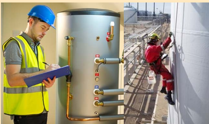
Pressure vessels inspection

Within the occupational health and safety sector and in order to have confidence in the data generated by inspection bodies in Zimbabwe, the National Social Security Authority (NSSA) under which the Factories and Works Inspectorate falls hence the regulator requires all inspection bodies to be accredited in accordance with ISO/IEC 17020 in order to be registered as an independent inspection authority. Following the requirement by NSSA, SADCAS has received 9 accreditation applications from inspection bodies operating in Zimbabwe. Four of the inspection bodies have already been accredited on the SADCAS Inspection Bodies Accreditation Programme and registered as inspection authorities by NSSA. A number of inspection bodies are still under process. A Memorandum of Understanding (MOU) spells out the operational relationship between SADCAS