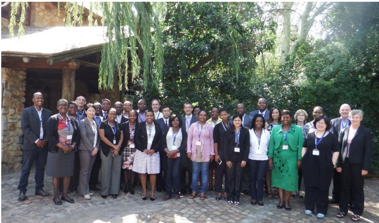
Delegates at the ILAC MCC and IAF CMC Meeting pose for a photo at the Farm Inn Hotel in Pretoria, South Africa

Over 3 full days the Committee deliberated on various aspects of the ILAC and IAF marketing strategy and monitoring progress thereof.