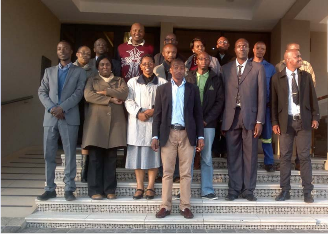
During meeting with LANCOQ Management

Participants expected a clear understanding of the ISO/ IEC 17025 Standard, knowledge of implementing the Standard, knowledge of the benefits of accreditation and skills for convincing top management to provide the necessary resources for accreditation. The course delivery prompted lively participation and discussions. The training course ended at 17:30 hours.