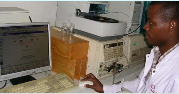
Fish testing laboratory

At a macro level accreditation can help by reducing the regulatory burden upon commercial organizations. Making regulation more effective and less onerous is a common goal for governments across the world.