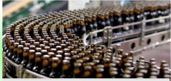
NBL bottling plant

Based on the feedback from participants at the end of the course, there was a general satisfaction with the venue and food. All participants felt that the course was well planned, useful and that there was enough time for discussions. The Trainer’s methods and presentation were rated as very good while the Trainer’s knowledge on the subject was rated as highly skilled. Most participants rated the overall assessment of the course between good and very good. The SADCAS course continues to deliver a content-heavy, practically relevant and well-organized course which was enjoyed immensely by the NBL staff.