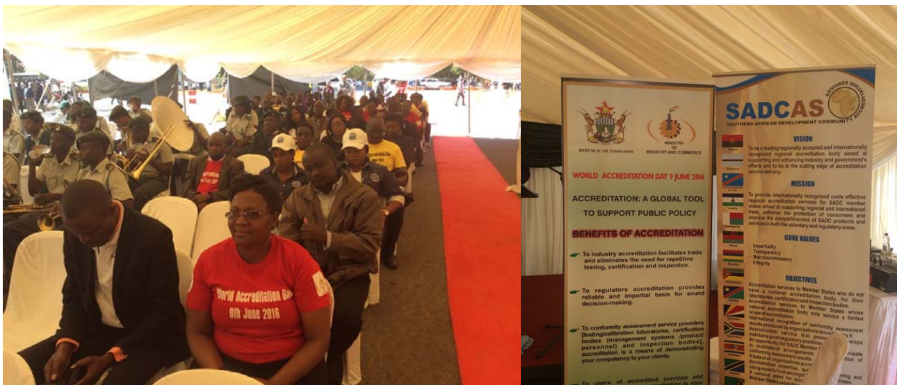
Some of the participants at WAD commemorations