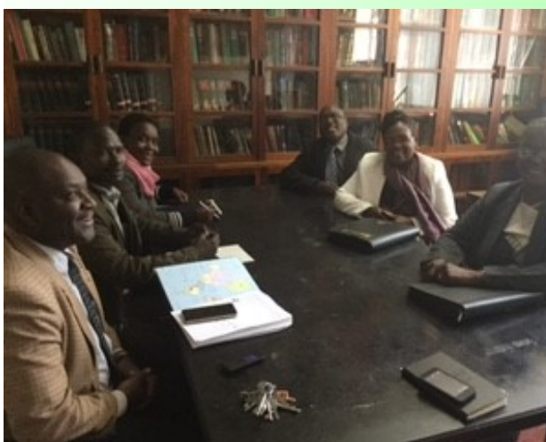
Meeting in session