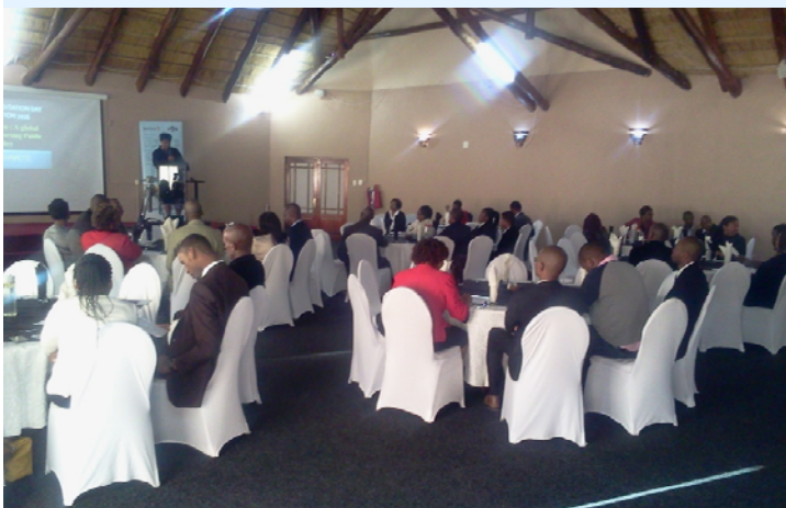
Participants at the breakfast commemorations

Swaziland joined the World and commemorated the WAD on the 29 th of June, 2016. In line with the theme for 2016 WAD, the NAFP engaged the Cabinet, Principal Secretaries, Members of Parliament and Regulators for the commemoration of the World Accreditation Day. Preparations started off in April with the sensitization of the Cabinet on WAD, the importance of accreditation and the role accreditation plays to policy makers. This was done through a Cabinet Paper. The WAD was then held at Sibane hotel in the form of a breakfast meeting and the event started at 7:30am and ended at 9.00 o'clock.