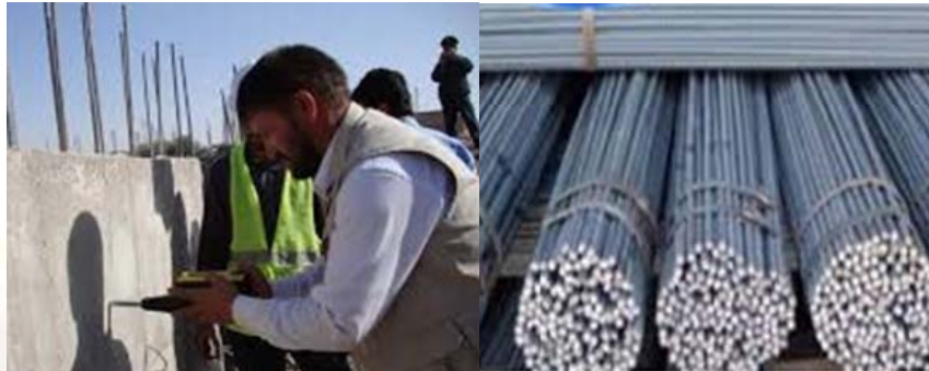
Quality of concrete