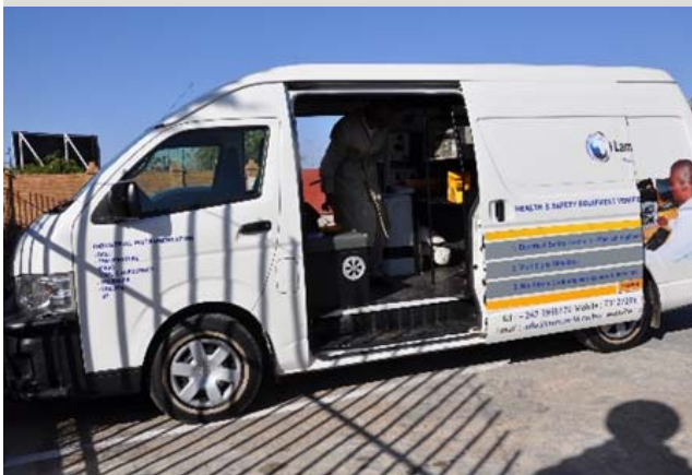
Mobile testing laboratories at the Lamworld Technologies stall