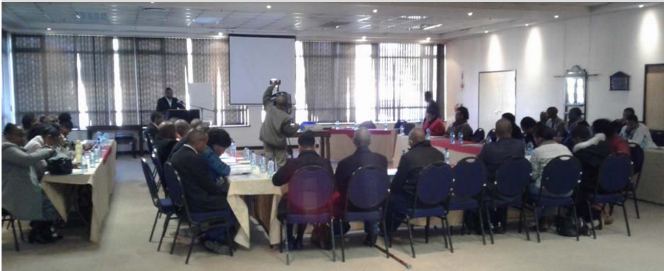
Conference in session

Various recommendations were made during the commemorations including the need for capacity development and the need for accreditation especially of CABs operating in the public domain including medical laboratories. Participants of the ISO/IEC 17025 training course held in December were called upon to implement what they had learnt and develop implementation programmes in their respective laboratories. All participants showed a remarkable enthusiasm which should result in significant developments towards accreditation in Lesotho.