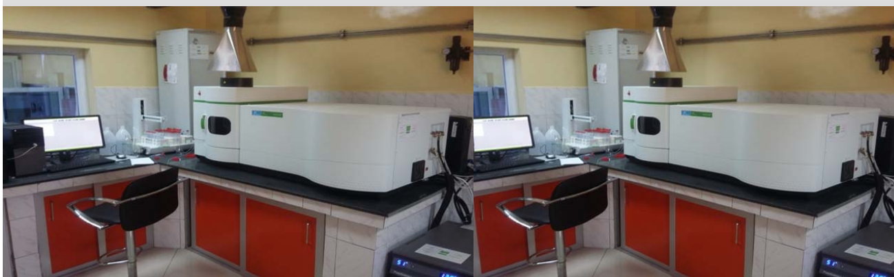
New OCC laboratory

In Lesotho WAD was celebrated on 29 June 2016. Prior to the celebrations, the office of the NAFP held a preparatory meeting together with members of the Lesotho Federation of Laboratories and Officers from the Government's / Regulator's Departments on 15 June 2016 during which a programme for the commemorations was decided upon. The WAD commemoration was attended by forty five (45) people from 21 organizations amongst them stakeholders from various Government ministries and regulators, private and public laboratories and the media. The Office of the Principal Secretary – Ministry of Trade and Industry presided on the official opening of the commemoration and thereafter the presentations were made by different organizations. The event was televised on TV Lesotho channel. One of the highlights of the event was the awarding of certificates 25 candidates who attended the ISO/IEC 17025 Standard Training and Auditing held in December 2015.