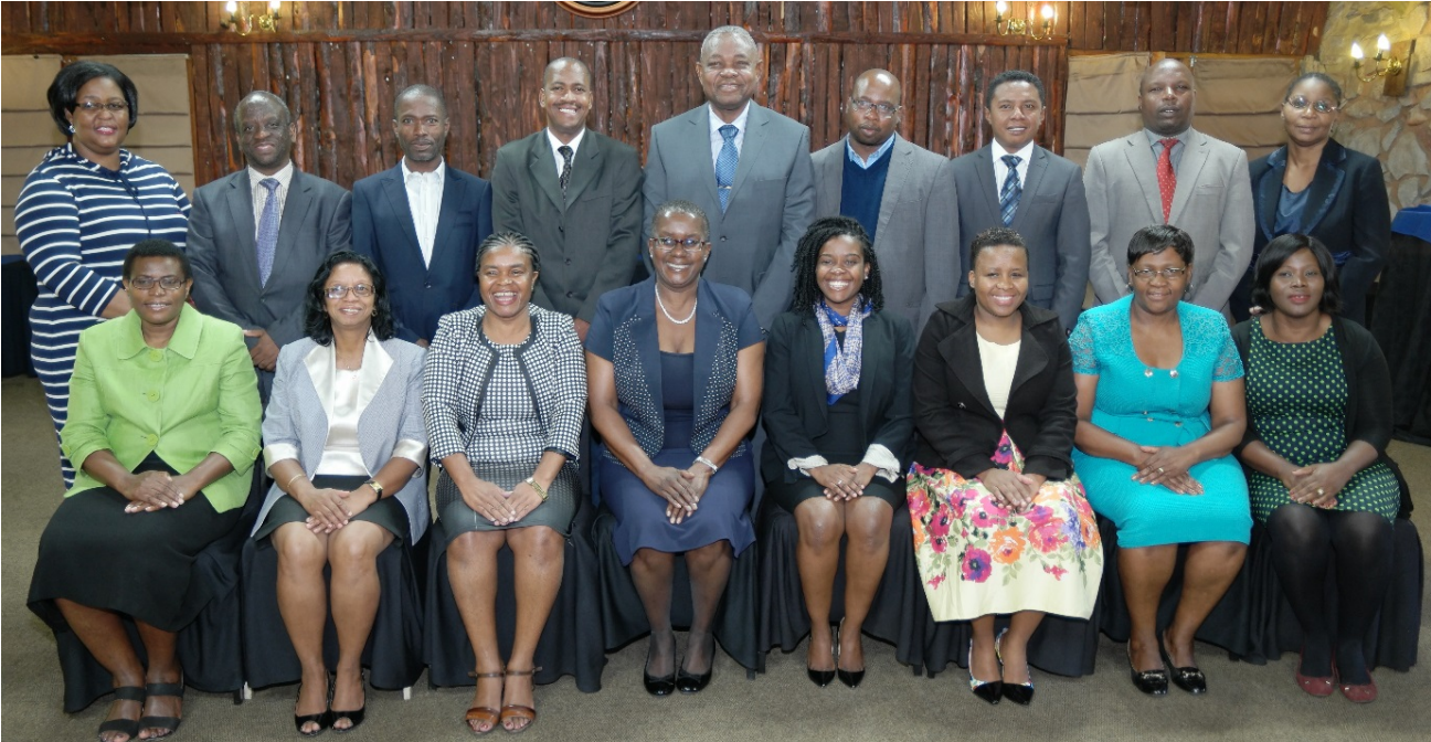
NAFPs pose for a photo during the 7 th NAFP meeting with SADCAS staff

The 9th SADCAS NAFP Annual meeting was held at The Farm Inn in Pretoria, South Africa on 22 April 2016. The meeting was attended by 14 NAFPs, SADCAS staff and Mr Jon Murthy, Chairman of the ILAC MCC/IAF CMC. National Accreditation Focal Points from Angola (1); Botswana (2), Democratic Republic of Congo (1), Lesotho (2), Madagascar (1), Malawi (1), Swaziland (2), Zambia (2), and Zimbabwe (2) attended the meeting.