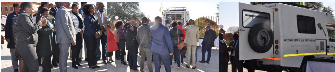
Delegates during the tour of stalls

A total of 4 organizations exhibited and showcased their activities at the exhibition during the commemorations, namely; Lamworld Technologies, National Blood Transfusion Laboratory, National Drug Regulatory Unit and the Department of Energy. The Department of Energy and Lamworld Technologies explained their trade using a petroleum mobile testing laboratory, and a mobile calibration Laboratory, respectively, which gave a vivid practical experience on their activities. National Blood Transfusion Laboratory used brochures and presentations whilst the National Drug Regulatory Unit used various portable Testing kits, books/reference pharmacopeia, brochures and presentations to explain their laboratory activities.