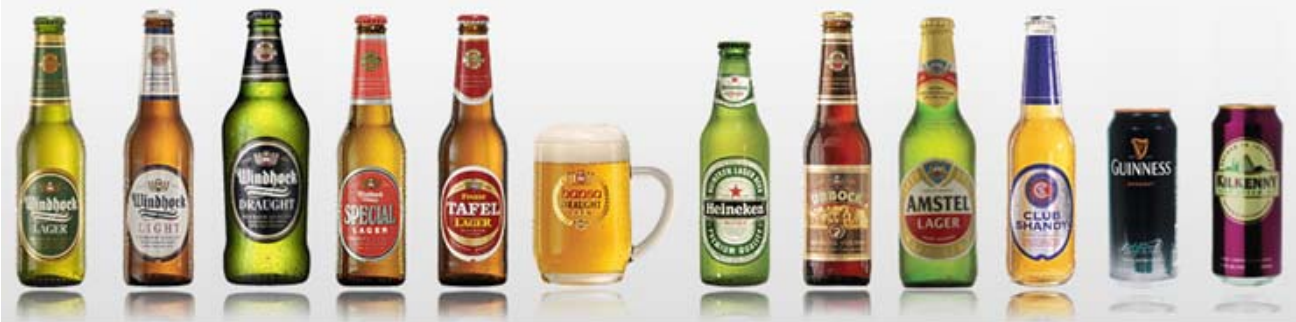
Windhoek Lager | Windhoek Light | Windhoek Draught | Windhoek Special | Tafel Lager | Hansa Draught | Heineken | Urbock | Amstel Lager | Club Shandy | Guinness | Kilkenny

The training course started on 13 June 2016 with opening remarks by the Laboratory Manager followed by remarks by the Trainer who gave the participants some background on SADCAS as well as what to expect from the course. A pre course quiz was undertaken by the participants in order to determine the level of understanding of the standard enabling the Trainer to identify areas of emphasis during the training. The training course which was interspaced with well - structured and detailed practical exercises undertaken in groups, was lively and interesting as the participants showed interest in the training and were asking a lot of relevant and practical questions. The participants enjoyed the training and promised to go back and implement what they had learnt. At the end of the training participants wrote an examination which formed the basis of evaluating the participants. The participants were also continuously evaluated during the training course.