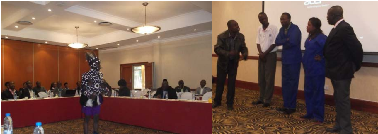
Twatasha Dance Group performing on the 2016 World Accreditation Day

The half day workshop was successful and it is therefore, prudent that the Ministry makes a follow-up on the required actions as stipulated in the recommendations. Further, it was extremely heartening to experience an entire industry coming together to commemorate the 2016 World Accreditation Day and to note that the Centre for Veterinary Research Institute has applied for accreditation.