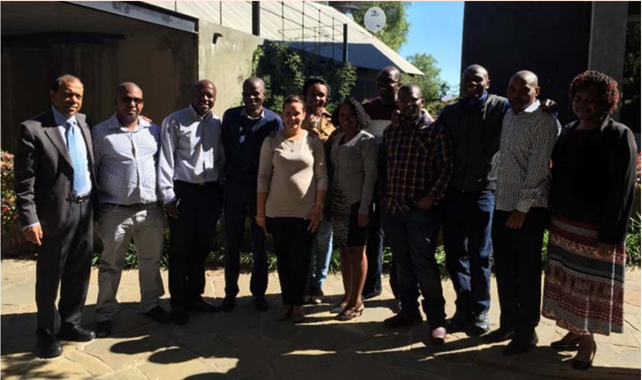
Course participants pose for a photo with the Trainer

The objective of the open course was to train interested laboratory staff in Namibia on the requirements, implementation and internal auditing to the new standard ISO 15189:2012. The course content included: Introduction to accreditation, a comprehensive elaboration on each clause of the management and technical requirements of ISO 15189:2012, method validation, monitoring compliance thereof through internal auditing, SADCAS accreditation process and a brief account on the SADCAS TR 10 - SADCAS Policy - ISO 15189:2012 Transition for Medical Laboratories that had implemented a system based on ISO 15189:2007.