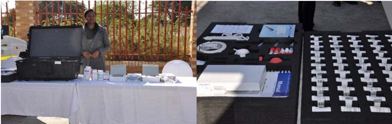
Department of Drug Regulatory Unit stall