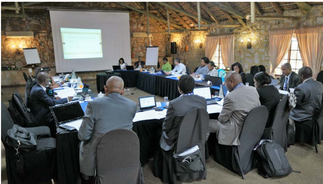
NAFPs meeting in progress

the ILAC MRA mark of which approval can be obtained from SADCAS. The NAFPs also committed to step up their promotion and marketing efforts and utilizing the knowledge gained from the marketing workshop and attendance to the ILAC MCC and IAF CMC meetings to realize the objectives set in the SADCAS 2016/17 budget.