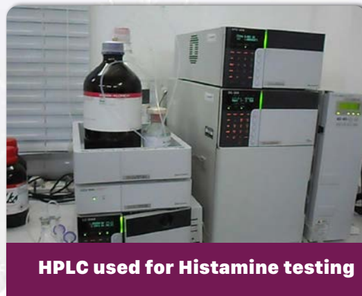
HPLC used for Histamine testing