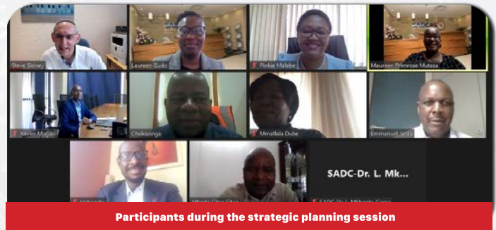
Participants during the strategic planning session

The session was highly interactive with members fully participating providing management with the strategic direction to draft the 2022-2027 Strategic Plan with the theme 'Service Excellence and Growth' which was subsequently approved on 18 November 2021. This 4 th SADCAS Strategic Plan draws on the lessons learnt and successes so far to endorse further efforts that are needed to take SADCAS to the next phase of service excellence and growth. It reflects the company's continuous improvement philosophy designed to ensure that SADCAS continually operates as a sustainable, dynamic and customer focused organization. The approved strategic plan was subsequently presented to the NAFPs at their 15 th annual meeting held on 25 November 2021.