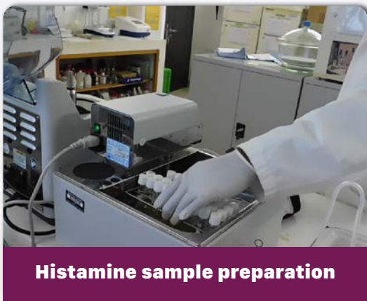
Histamine sample preparation

The laboratory has extended the scope of accreditation based on the needs of the industry to facilitate trade.