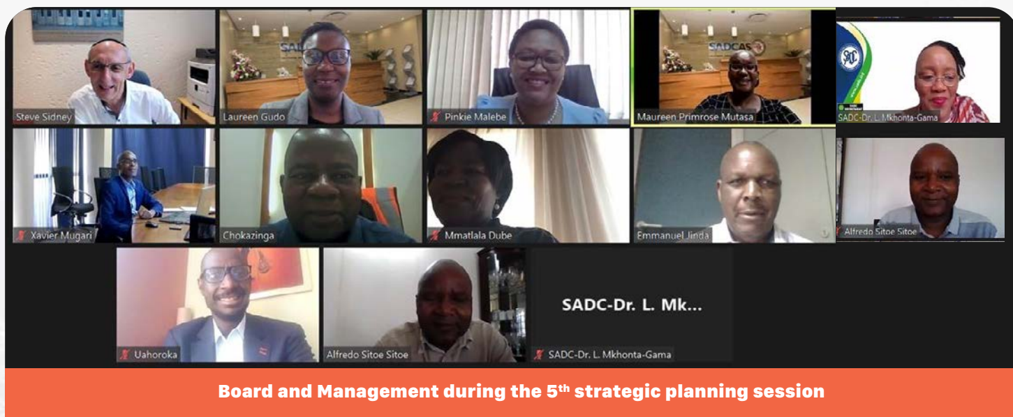
Board and Management during the 5 th strategic planning session

was developed at the 5 th Board strategic planning session which was held virtually from 30 September to 1 October 2021 and attended by all Board members and Management.