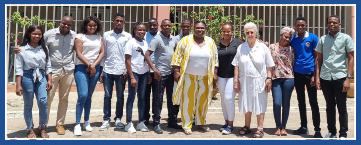
Participantes no curso de formação sobre a Norma ISO 15189:2022