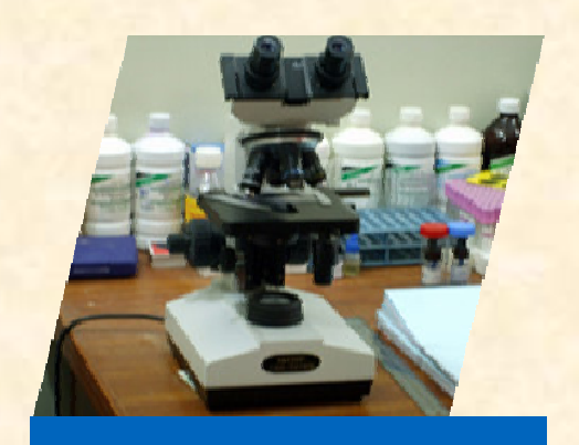
Medical Laboratory Accreditation Programme (MLAP)