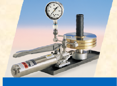
Calibration Laboratory Accreditation