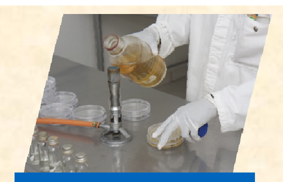
Testing Laboratory Accreditation Programme (TLAP)

The pamphlets can be obtained from the SADCAS head office, National Accreditation Focal Points (NAFPs) in the respective SADC countries that are serviced by SADCAS or they can be downloaded from the SADCAS website by following the link <a href="http://www.sadcas.org/promotionalMaterial.php">http://www.sadcas.org/promotionalMaterial.php</a>.