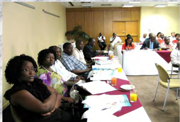
Participants at the stakeholders' meeting in Namibia