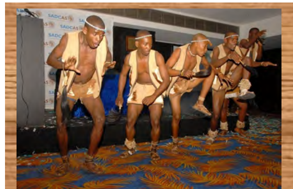
Shumba Ratshega Traditional Dance Group entertaining guests during SADCAS launch