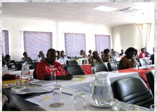
Participants at the stakeholders' meeting in Swaziland