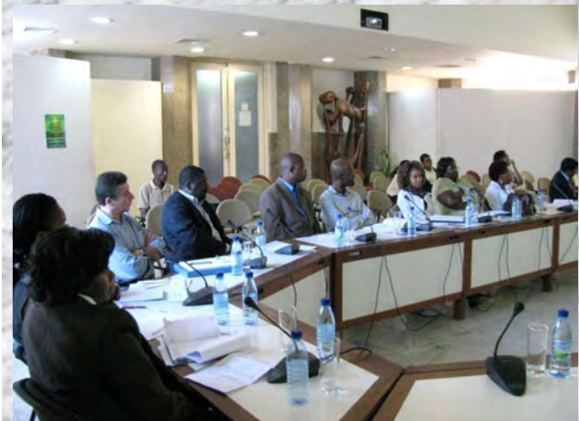
Participants at the stakeholders' meeting in Mozambique