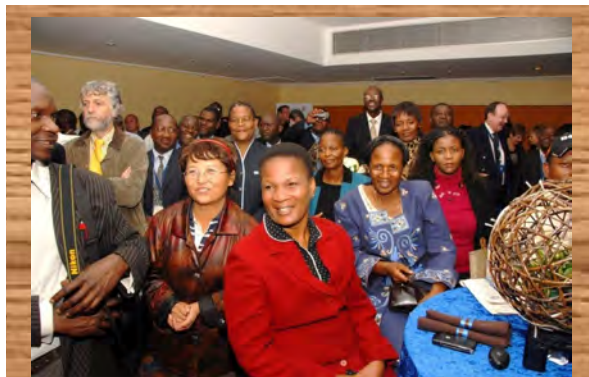
Some of the invited guests at SADCAS launch

In his speech the guest of honour noted the key role that accreditation plays in socio-economic development and welcomed the establishment of SADCAS. He urged conformity assessment service providers to take up the services offered by SADCAS as a demonstration of competency and a means to build trust/confidence amongst trading partners. He further noted that all stakeholders including the general public stand to benefit from accreditation. The Minister also encouraged SADC member states to facilitate the acceptance of SADCAS in their own countries and to continually support the National Accreditation Focal Points which are the administrative links between SADCAS and member states.