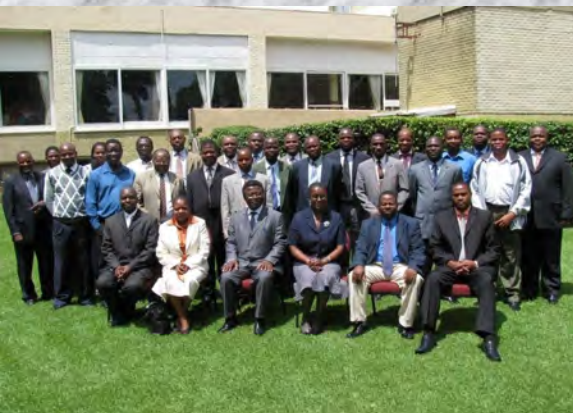
Participants posing for a photo during a stakeholders' meeting in Malawi