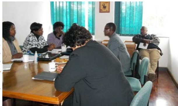
Meeting with BRTI officials

In all the visits, the SADCAS team met with the conformity assessment bodies' management, key laboratory staff during which an overview of SADCAS was given and the accreditation process was outlined. Discussions were also held in order to know more about the conformity assessment bodies and to get at first hand the challenges they are facing as they work towards accreditation. The meetings were then followed by tours of the laboratory except the Standards Association of Zimbabwe which had been toured in a previous visit.