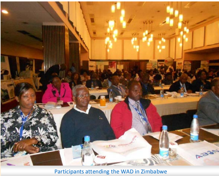
Participants attending the WAD in Zimbabwe