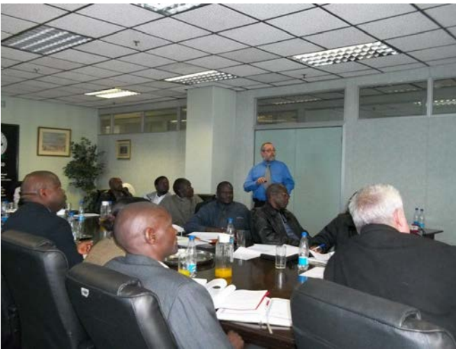
Advisory Committee meeting in progress