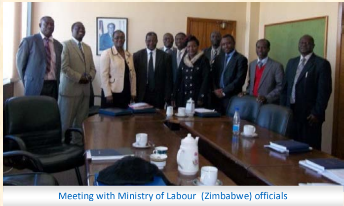
Meeting with Ministry of Labour (Zimbabwe) officials

In order to have confidence in the data generated by inspection bodies in Zimbabwe, NSSA under which the Factories and Works Inspectorate falls, requires all inspection bodies to be accredited in accordance with ISO/IEC 17020 in order to be registered as an independent inspection authority. Throughout the world many countries now rely on accreditation as a means of independently evaluating the competence of inspection bodies. Following this requirement by NSSA, SADCAS has received 9 accreditation applications from inspection bodies in Zimbabwe. Eight of the 9 applications have already gone through the documentation review stage and are due to undergo pre-assessments in August and September 2012. One application is still at approval of quotation stage. The SADCAS Inspection Bodies Accreditation Program was launched in June 2010.