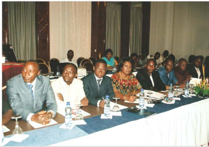
Participants attending the WAD Conference in DRC