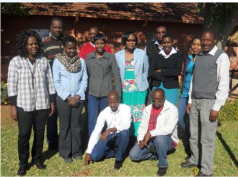
Participants pose for a photo during the training

SADCAS conducted a five days' ISO/IEC 17025 training course at Oasis Motel in Gaborone, Botswana. The course which held from 23 to 27 July 2012 was attended by 11 participants from 5 different laboratories and from the National Accreditation Focal Point – Botswana. The laboratories are at different stages of implementing laboratory management system with one of the laboratories having already been assessed and are in the process of clearing non conformities, one laboratory is pending assessment, one applied for accreditation whilst the other 2 are various levels of developing and implementing their laboratory management systems.