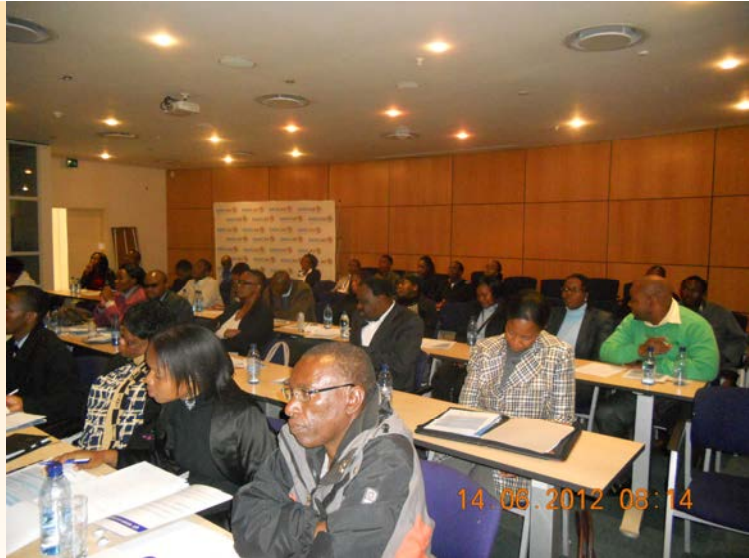
Participants attending the WAD Conference in Botswana