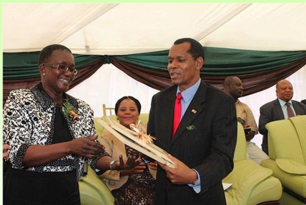
Mrs MP Mutasa hand over accreditation certificate to Hon. Francis Nhema—Minister of Environment and Natural Resources

Honourable Francis Nhema, Minister of Environment and Natural Resources Management commended EMAL for the achievement and emphasized the need for ultimate goal achievement which is a clean, safe and healthy environment and sustainable use of natural resources. He then called upon Guest Singer Mr Derek Mpfu to play some songs all of which were highlighting the need and importance of a clean safe and healthy environment and to maintain the beautiful country Zimbabwe.