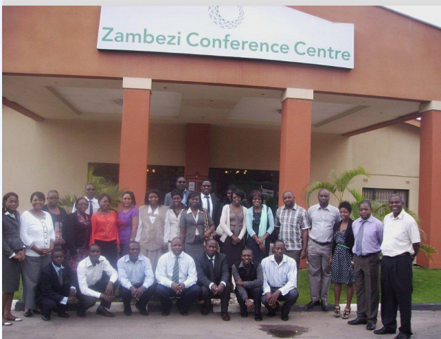
Participants pose for a photo during the 5-day training course in Zambia