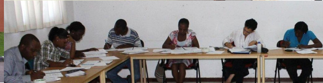
Five-day training in progress in Mozambique

The challenges faced by governments and society in ensuring safe food call for the need for technical competence of conformity assessment bodies (9 testing laboratories/certification bodies/inspection bodies) involved throughout the food supply chain. Accreditation is now widely accepted as the most transparent, non discriminatory mechanism to assure competency of conformity assessment service providers thus ensure the safety of food. Accreditation is the basis of trust between trading partners.