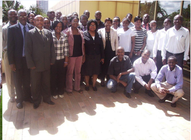
Participants pose for a photo during the 5-day training course in Zimbabwe