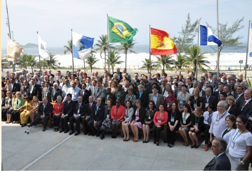
Delegates at the 2012 IAF/ILAC Annual Meetings

On the other hand 3 associates, 3 affiliates and one stakeholder were admitted into the various categories of ILAC membership since the 2010 annual meetings. During the meeting, 2 members were upgraded to associate category whilst one organization was admitted as a Stakeholder member. The total ILAC membership of 144 bodies now covers 109 different economies worldwide. Approximately 43,000 laboratories and over 6,600 inspection bodies are accredited by the 77 ILAC Full Members who are signatories to the ILAC Arrangement.