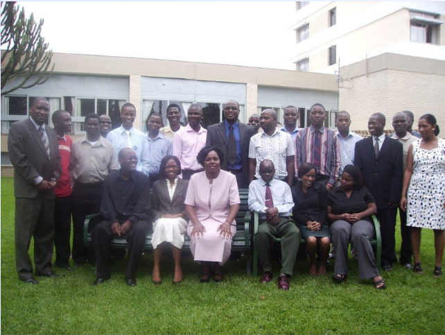
Participants pose for a photo during the 5-day training course in Malawi