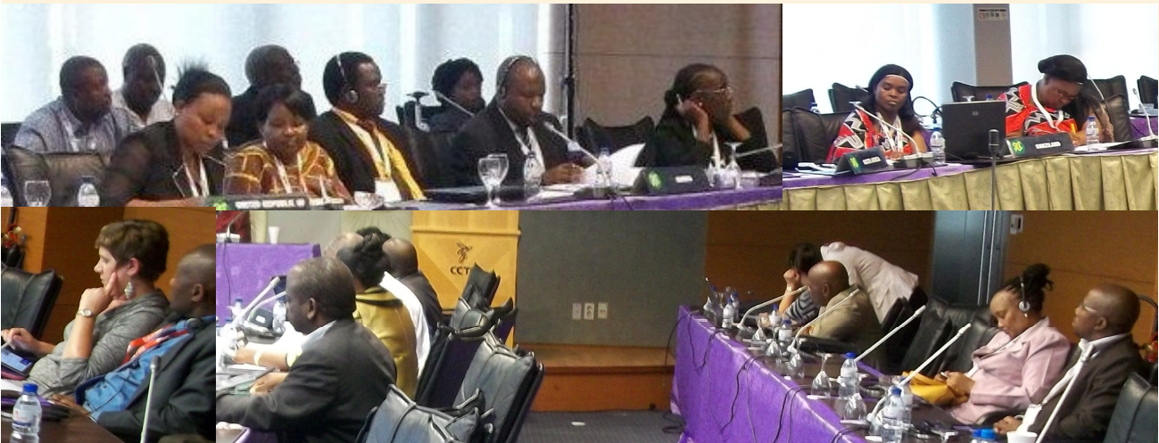
8th SADCAS Annual General Meeting in session

The Southern African Development Community Accreditation Service (SADCAS) held its 8 th Annual General Meeting on 19 March 2013 at the Talatona Convention Center in Luanda, Angola. The SADCAS General Assembly is the governing body of SADCAS and comprises of subscribers to the memorandum and articles of association, members of the Board of directors, appointed representatives of national Accreditation Focal points (NAFPs) in each SADC Member State using the services of SADCAS, and individuals or organizations who apply for admission as members of SADCAS. The SADCAS General Assembly currently comprises of 40 members. Drawn out of the General assembly is the Board of Directors which oversees the running of SADCAS and fulfils any functions that the SADCAS General assembly may delegate to it. In line with its Articles of Association, SADCAS holds a general meeting in each year as its Annual General Meeting (AGM). The AGM which was held in conjunction with the 28 th meeting of SADC experts on standardization, quality assurance, accreditation and metrology was attended by 37 general assembly members and observers.