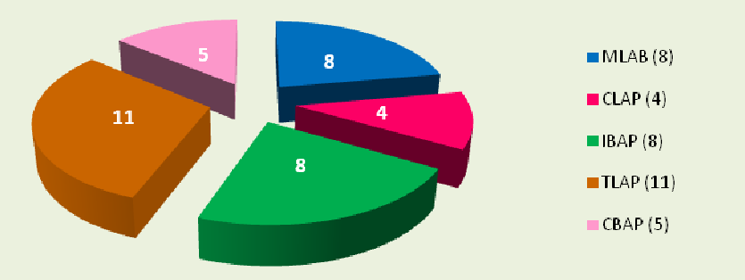
Figure 2 - Breakdown of Registered Technical Assessors According to Field

The cost of travel of the assessment team who undertake assessment in the countries serviced by SADCAS constitutes about 50% of the cost of accreditation. As much as possible assessors should be locally based so as to minimize the cost of accreditation. Training of assessors is therefore an ongoing activity in SADCAS. A further pool of experts are expected to undergo training as assessors under the auspices of the SADC EU EDF 10 REIS project which is now underway. Training of assessors will be prioritized based on scope of demand and the anticipated scopes of demand and taking into account the current pool of registered assessors.