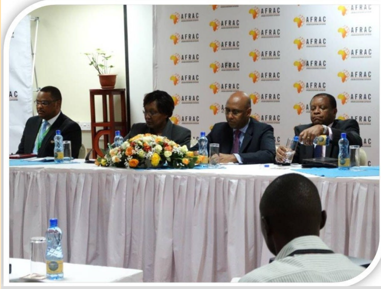
AFRAC General Assembly meetings were starting. He highlighted the important role of trade in the continent's development. "Although Africe has 10% of the world population Africa

In his key note address, Honourable Adan Mohamed started off with a request to the august body for a minute's silence in remembrance of all those who had died and injured as a result of the terrorist attack at the Westgate Mall in Nairobi on Saturday, 21 September 2013 just as the AFRAC General Assembly meetings were starting. He highlighted the important role of trade in the continent's development. "Although Africa has 10% of the world population, Africa