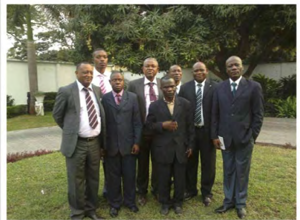
Trainee assessors pose for a photo in Kinshasa, DRC