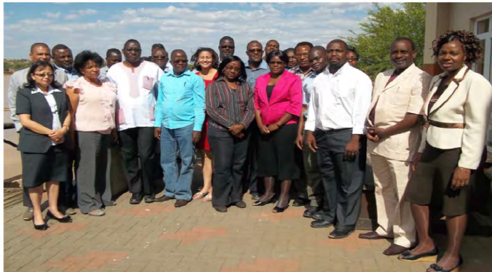
Participants pose for a photo during the training course in Windhoek, Namibia

This ISO/IEC 17025 Requirements and internal auditing course was the fourth such course to be held by SADCAS in Namibia with the first 3 ISO/IEC 17025 courses having been held in August 2011, March 2012 and in September 2012. SADCAS has also undertaken one other accreditation related training course on ISO/IEC 17020 for inspection bodies in Namibia. This is a demonstration and realization of the need and importance of accreditation in Namibia.