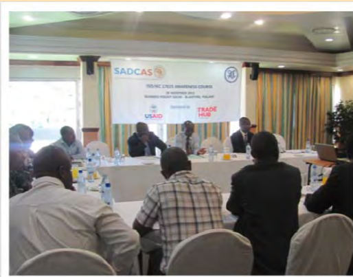
Participants attending the one-day awareness training in Blantyre, Malawi on 29 November 2012