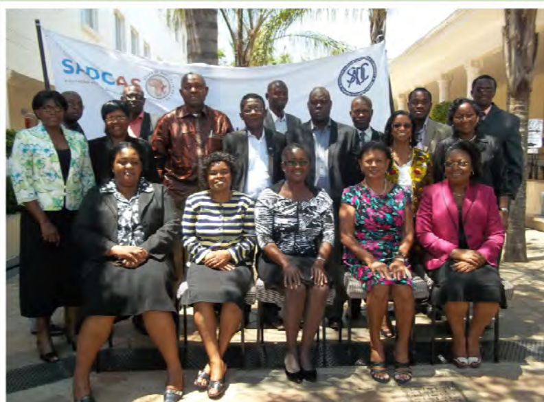
Participants pose for a photo during the 6th NAFP Annual Meeting held in Johannesburg, South Africa