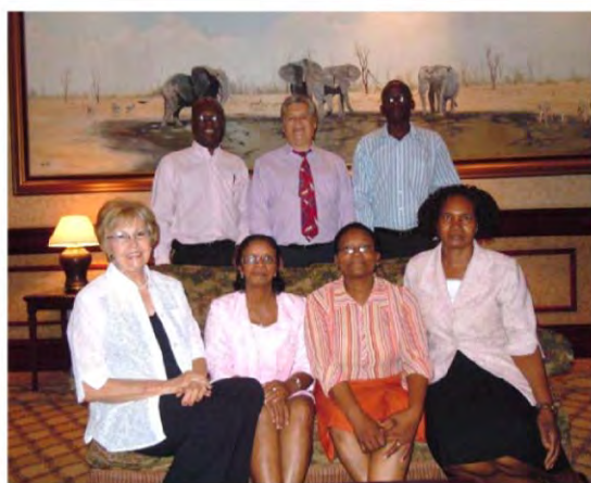
Participants at the Botswana mentorship training programme

and the evaluation for the remained candidates will continue until 31 March 2013. The trainee assessors qualified after the on-site evaluation will be registered as SADCAS Lead and/or Technical assessors and will undertake assessments on behalf of SADCAS in SADC Member states when needs arise. SADCAS would like to thank PTB-Germany to sponsor the mentoring stage as SADCAS need a pool of assessors based in SADC member states that will contribute to reduce the cost of travel of the assessment team.