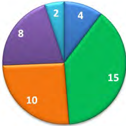
Breakdown of Accreditation Applications by Field