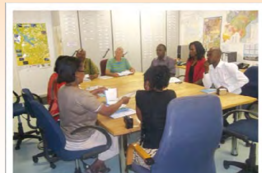
Meeting in progress during visit at Okavango Research Institute

The laboratories visited are at different stages of setting up systems and implementing the applicable standards.