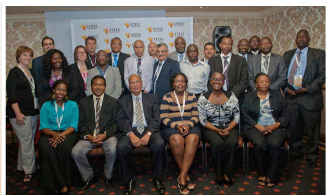
Delegates at the 3 rd AFRAC General Assembly held in Johannesburg, South Africa

He then encouraged stakeholders to formalize their membership. Regarding committees, 2 committees namely the MRA Committee and the Technical Committee had been established following the 2 nd General Assembly and met on 2 October 2012 whilst the Administrative Committee would be established as when need arises. Following the training of 12 peer evaluators in June 2011, one peer evaluator had participated in a peer evaluation with another trainee peer evaluator scheduled to participate in his first peer evaluation in February 2013. The Chairman also reported on the recommendations from the Accreditation Expert Working Group that in order to avoid duplication of efforts within the COMESA/EAC/SADC tripartite arrangement and to optimize limited accreditation resources, no new accreditation structures should be established and that AFRAC in the long term must be used as a platform for accreditation issues in Africa. The Accreditation Experts met in May 2012 in South Africa.