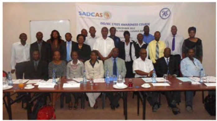
Participants pose for a photo during the one-day ISO/IEC Awareness training in Lusaka, Zambia on 3 December 2012