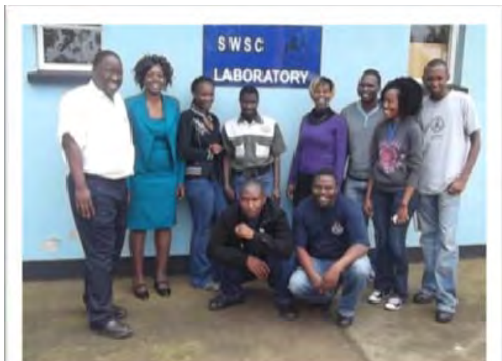
Participants pose for a photo during the training course in Mbabane, Swaziland

The SWSC operates water testing laboratories which offer chemical and microbiological analytical services. These services are in support of the SWSC's role in the development and maintenance of water resources and supplies in Swaziland. The laboratory undertakes chemical and microbiological analyses of water and waste water samples and was accredited to ISO/IEC 17025 in March 2012.