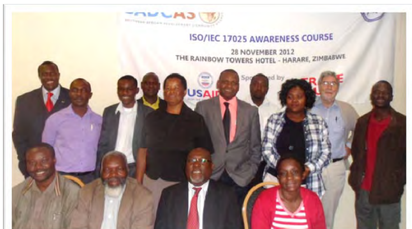
Participants pose for a photo during the one-day awareness training in Zimbabwe on 28 November 2012

The resource person for the courses are drawn from a pool of SADC qualified and experienced trainers who have hands on experience in implementing ISO/IEC 17025 and undertaking internal audits to ISO/IEC 17025.