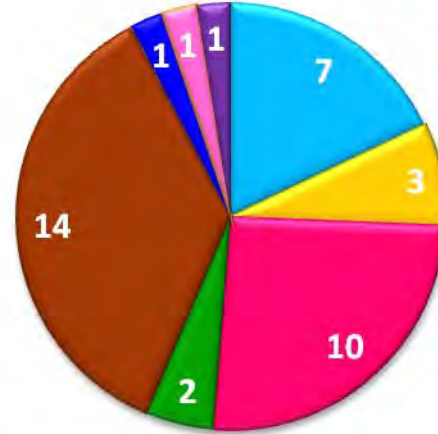
Breakdown of Accreditation Applications by Country