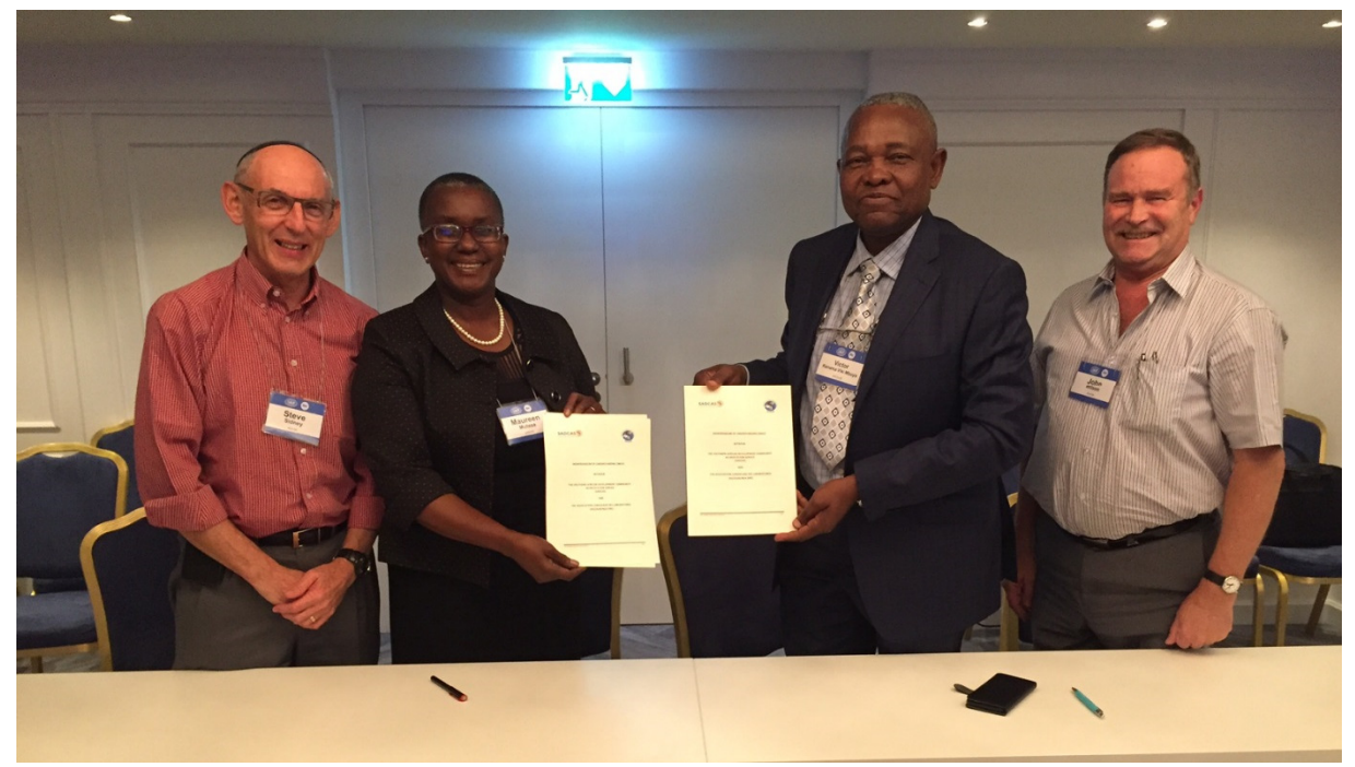
Displaying the signed MOU